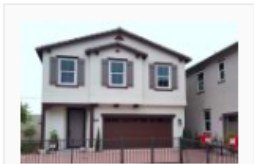
New Homes in Oceanside PEPPER TREE at Mission Lane

83 New Detached Homes From the $560,000s Oceanside Inland 3 to 4 Bedrooms 1,790 to 2,157 2-Car Attached Garages Community Pool 2.5 to 4 Bathrooms