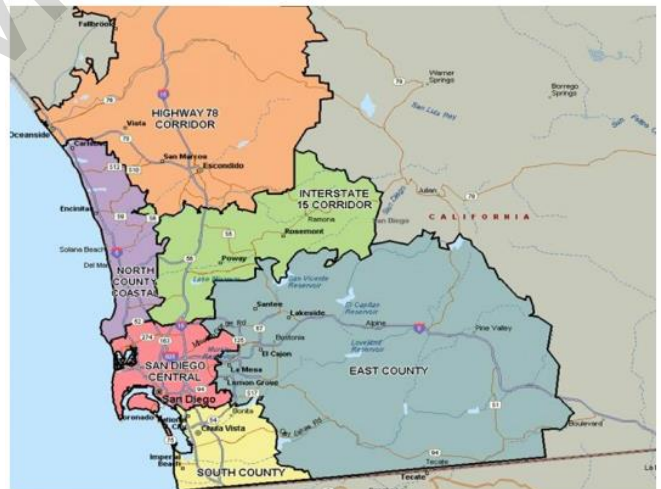
San Diego County Map: